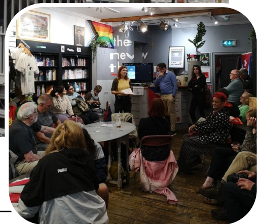
Cuba medical aid fundraiser in Connolly Books, July 26 th