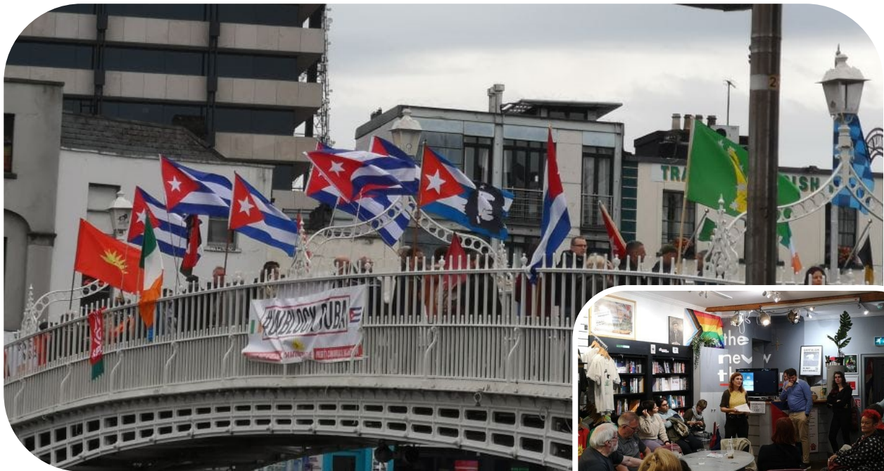
Solidarity demonstration in Dublin, July 26 th